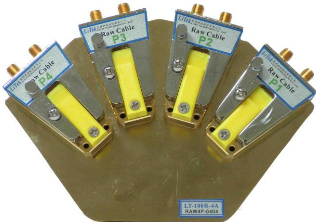
Fig 1: LT-100R-4A Raw Cable Test Fixture Set