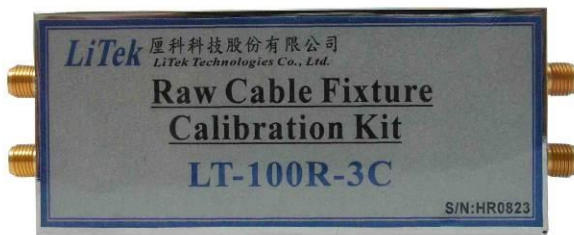
Fig 2: LT-100-3C (2X Raw Cable Calibration Kit)

Most of the interfaces are designed by differential 100 ohms system, just like SATA, SAS, Lan, Infiniband, DVI, HDMI, SFP.. etc. The bandwidth of these interfaces is wide up to 10GHz or more. In this way, a good test fixture (Jig) for testing the raw cable with multi-AWG range becomes very important.